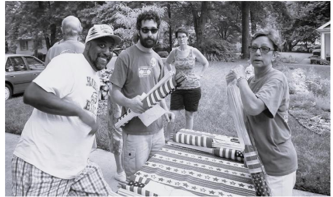
Flag Night volunteers get ready to do their routes in 2014.

Bag what you mow. Grass clippings otherwise accumulate and create unsightly trails and piles – "thatch" -- that don't go away and block water your lawn needs. Next spring, you may need to aerate your own lawn: Hire someone with a machine that will poke holes