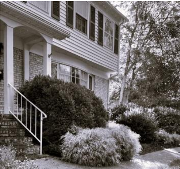
September 2022 Kay & Terry Montross, 6511 Farmingdale Drive.