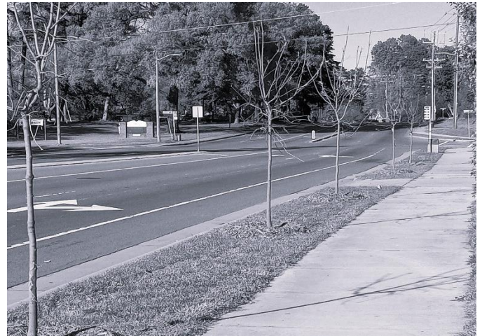
New city-planted trees, looking north on Sharon Amity Road, between Kipling Drive and Amity Place.

5201 Amity Place List: $405,000 Price: $415,000