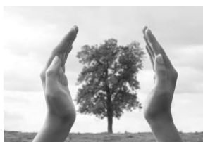
Our roots run deep